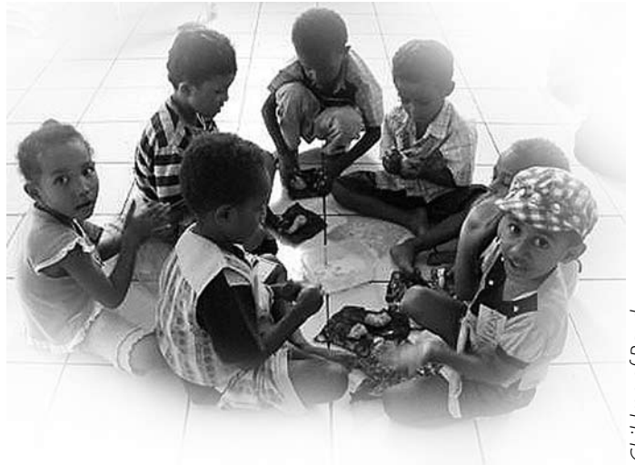
Children of Paud